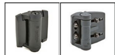
D&D TRUClose Hinge