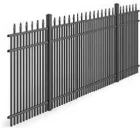
UAS 101 SPEAR TOP With 1-5/8" spacing residential and 1-1/2" spacing commercial