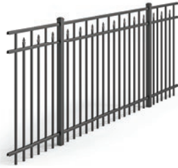
UAF 250 FLAT TOP W/SPEAR 3-Rail fence with spear top pickets between mid and top rail