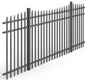
UAS 300 CONCAVE SPEAR TOP 3-Rail fence with spear top pickets in concave formation above top rail