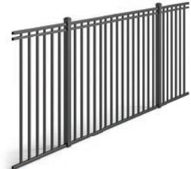
UAB 200 FLAT TOP FLUSH 4' H x 6' W, 3-Rail