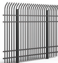
UAD 100 DEFENDER SPEAR TOP Defender security fence with angled spear top pickets