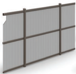
ULTRA™ VINYL PRIVACY FENCE ALUMINUM+VINYL Aluminum Frame for Tongue and Groove Vinyl Inserts