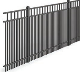
UAF 201 FLAT TOP With 1-5/8" spacing residential and 1-1/2" spacing commercial