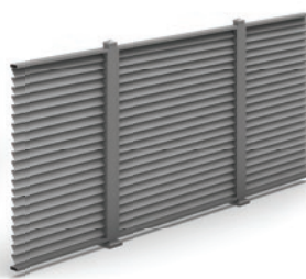
ULTRA™ LOUVERED PRIVACY FENCE Aluminum Frame and Louvers